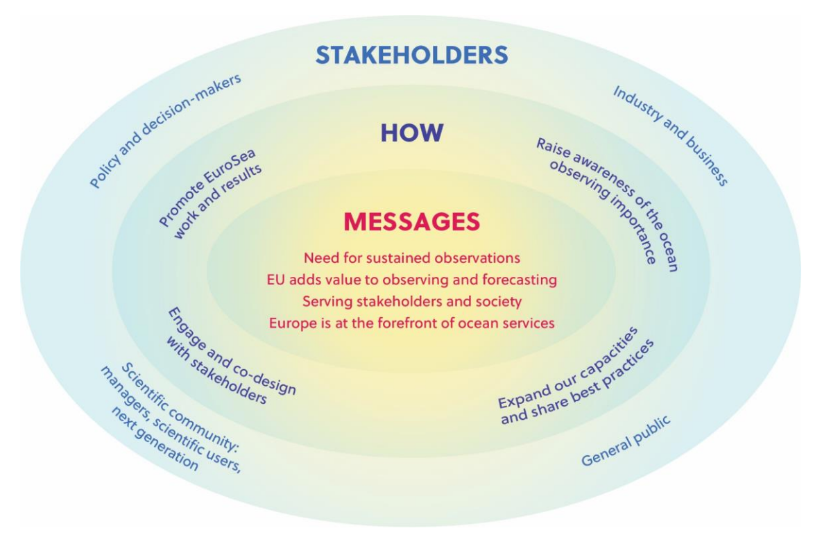
Diagram 3: EuroSea big messages, communication tool categories, and key stakeholder groups

The value of effective project communication is in delivering clear messages to the project stakeholders through a set of targeted communication tools. EuroSea communication aims at supporting the project's activities and stakeholder engagement. But above all EuroSea communication aims at making a strong and impactful contribution to the project's high-level objectives of promoting ocean observing importance, sustainability, and integration. These are referred to as the EuroSea big messages and will be transmitted through all our communication and engagement activities.