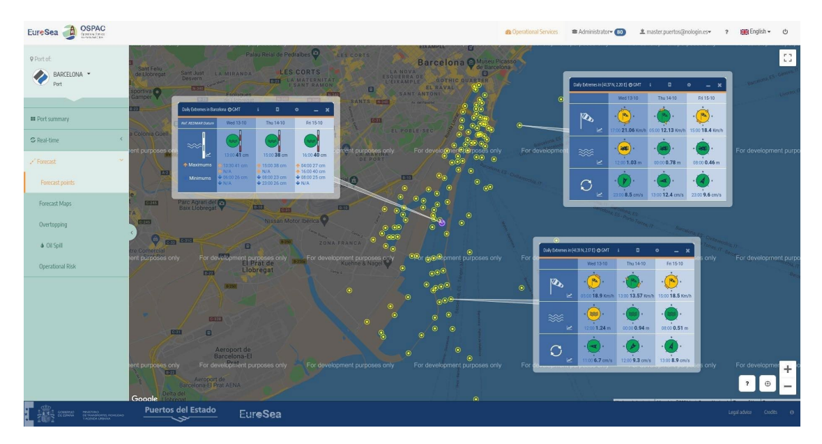
Figure 1. Screenshot of the OSPAC software (desktop version). Forecast points at several points of the Barcelona harbour.

The OSPAC software system consists of an integrated set of tools and measuring instruments that will provide an operational service to the city and the adjacent port in order to minimise risks and improve environmental management. There are two main layers to the system. The first layer includes forecast models of local sea conditions. The second layer is the software that is being developed to provide real-time alerts based on the models. The system will provide an integration layer that will work with existing forecast models for wave, sea level, sea surface temperature and circulation conditions. The software will use the models to deliver real-time alerts by SMS and email to provide forecasts of sea conditions, rip currents, flushing times, floating debris and flood and erosion risk. The use of local models, depending on their availability, will enable the system to be rolled out to other ports. (Figure 1)