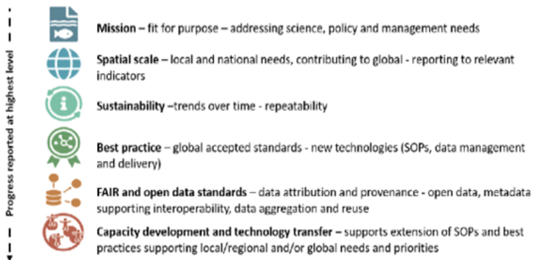
Figure 1. GOOS OCG network criteria, also applicable to observations of all EOJs.

Such an observing network would also bring together different citizen science initiatives aimed at microplastic and/or macroplastic observations from non-commercial (sailing and other recreational) vessels. This activity will be included in the larger cooperation effort led by OceanOPS within the UN decade project