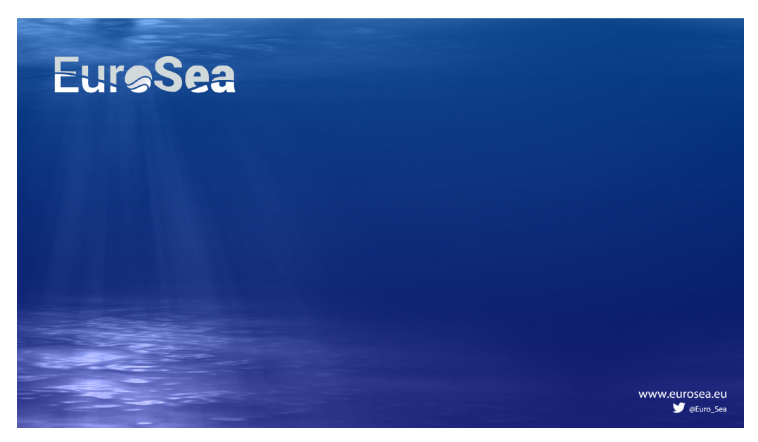
Virtual presentation background